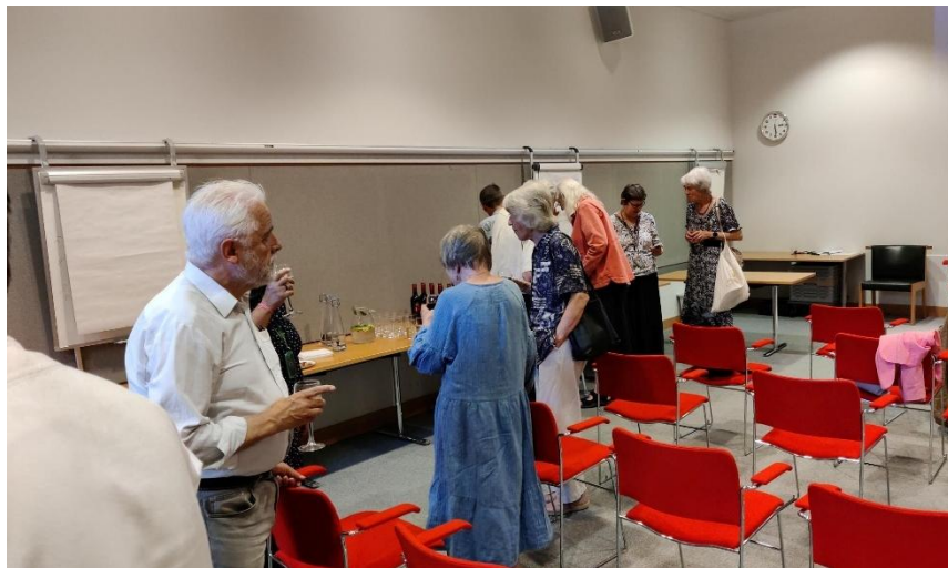
The drinks reception before the lecture