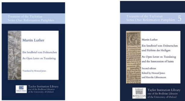
The front covers of two printed reformation pamphlets.